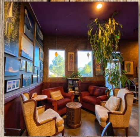
88 CUPS COFFEE & TEA

Round out a perfect day with a fine dining experience! Daniel's offers Country French cuisine and a delightful ambiance, located in Nevada's first settlement, Genoa. Reservations required (Open Tues-Sat).