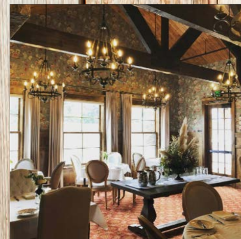
DANIEL'S IN GENOA